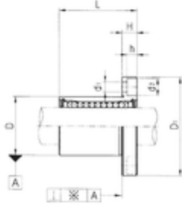
LMK30 Bearing 2D drawings and 3D CAD models